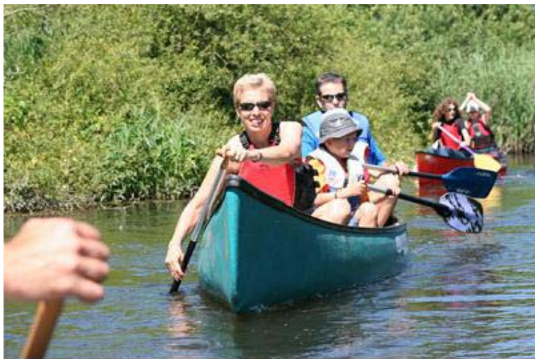
Canoeing in convoy.

Tucked away on a remote loop of the River Waveney, this is a perfect spot for relaxation and exercise. In addition to canoe hire it offers holiday accommodation to let, including lodges and apartments, holiday homes for sale, a family-friendly pub and restaurant – the Waveney Inn – a Nordic Leisure Centre with a heated indoor swimming pool, sauna and spa, a campsite for tents and touring caravans, a shop, a day cruiser, bicycle hire, boat servicing and private moorings.