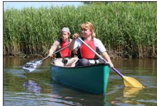
Wildlife on the water and canoeing through the reeds.