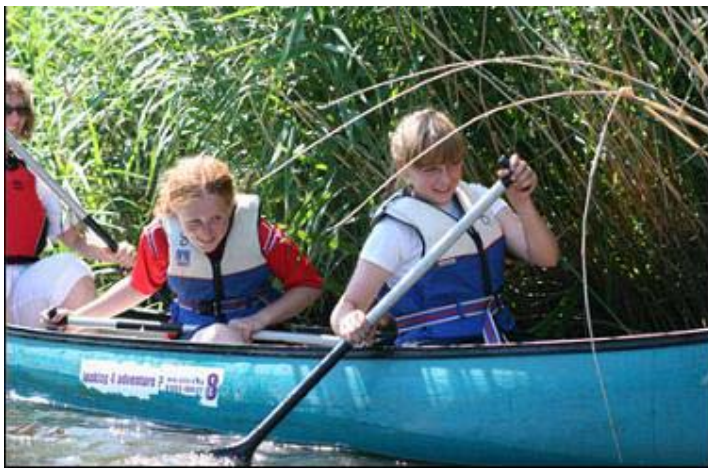
Paddling through the reeds.

A 10-minute walk from Hoveton & Wroxham station (with direct services to Norwich) and terminus of the Bure Valley Railway. If arriving by bus, get off at Roy's Shop in the village centre; Barnes Brinkcraft is a two-minute walk from the bus stop. There are plenty of places to eat and stay nearby and in the charming village of Coltishall only a further mile and a half along the B1345. For a full list see the section at the end of the guide.