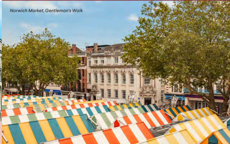
Norwich Market, Gentleman's Walk